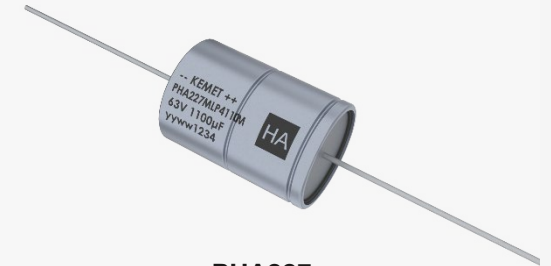
PHA227 Axial Crown