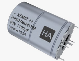
PHH227 Radial Crown